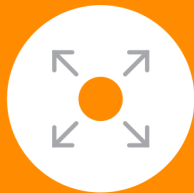
Practice social distancing