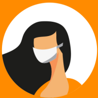
Wear a mask