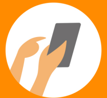
Call the helpline, if sick