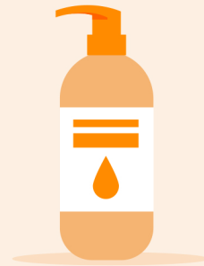
Stocked the sanitizers