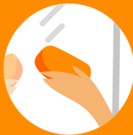
Wash hands often