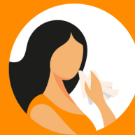
Cover your cough & sneeze