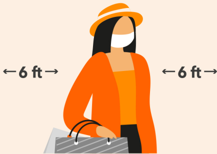
Keeping safe distance